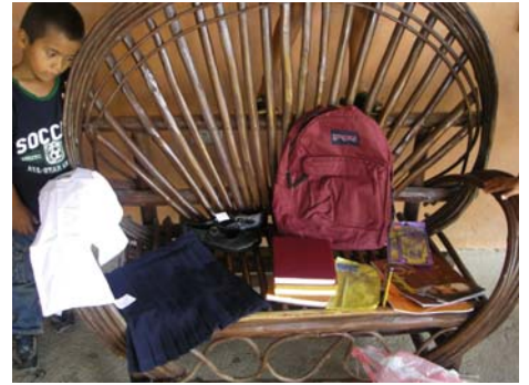
School supplies for 200 kids

The team put on their program with puppets and skits on three occasions, once at the government orphanage for 50 kids, again at a Sunday school service for over 200, and a third time for another 200 at the Heart to Heart orphanage.