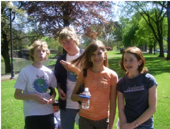
Four of the 2007 Walk-a-thon participants

Each year A Touch of Hope sponsors a minimum of three fundraisers in the Longview, Washington area giving kids an opportunity to help change the lives of children around the world. Rain or shine, kids come out for our spring walk-a-thon around Lake Sacajawea. It is a 7.11 mile walk in a tranquil setting. Tranquil at least until some of the participants decide to compete and turn the walk-a-thon into a race-a-thon. Nevertheless, the kids and adults have a good time.