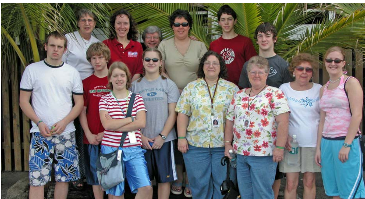
2006 Daily Vacation Bible School team from Castle Rock Christian Church

WORLDWIDE HEART TO HEART MINISTRIES, P.O. BOX 372, CARSON, WA 98610 509-427-8585, LYMAR@GORGE.NET